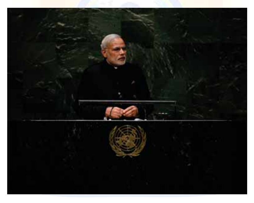
Speech of Honorable Prime Minister of India Shri Narendra Modi at the 69<sup>th</sup> session of United Nations General Assembly (UNGA) on September 27, 2014.

"Yoga is an invaluable gift of ancient Indian tradition. It embodies unity of mind and body; thought and action; restraint and fulfillment; harmony between man and nature and a holistic approach to health and well-being. Yoga is not about exercise but to discover the sense of oneness with ourselves, the world and Nature. By changing our lifestyle and creating consciousness, it can help us to deal with climate change. Let us work towards adopting an International Yoga Day."